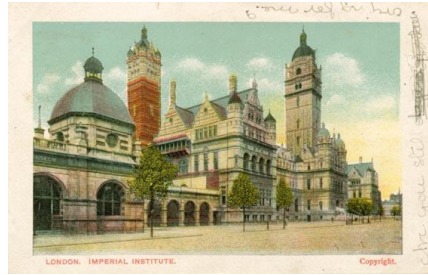
London's Imperial Institute